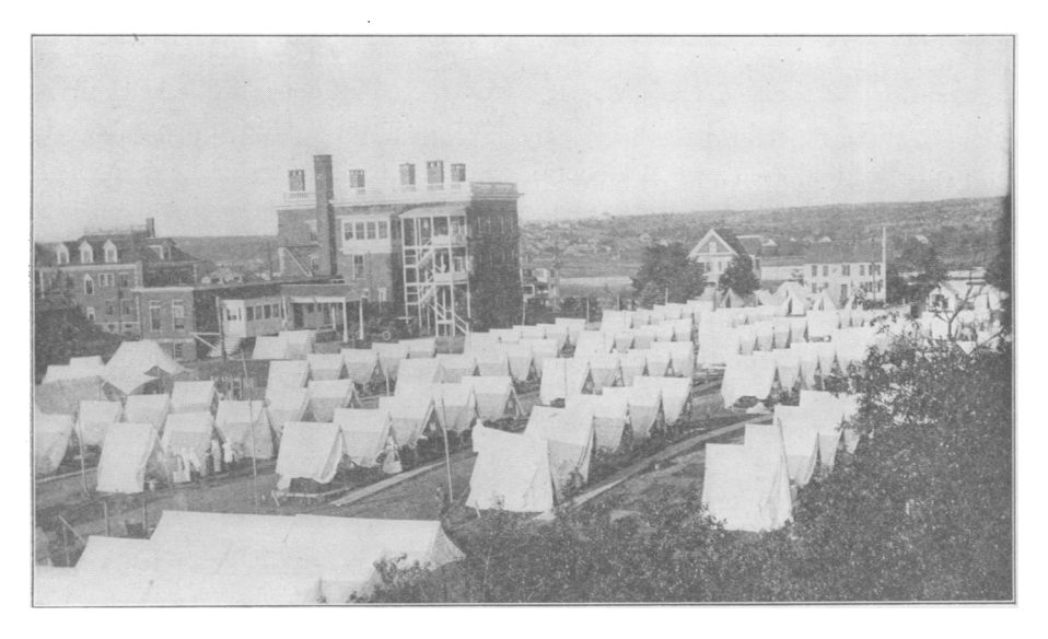
FIG. 1. Gloucester Hospital.*

the camp. The attending physicians were greatly puzzled, for the pneumonias did not seem to be of the type which are generally met with. The patients became greatly cyanosed and the ordinary heart medicines like digitalis and strychnine apparently had no effect, and seven or eight deaths occurred in rapid succession. The attending physicians became much discouraged. Meanwhile Doctors Slack and Overlander were busy taking cultures. They soon reported that the influenza