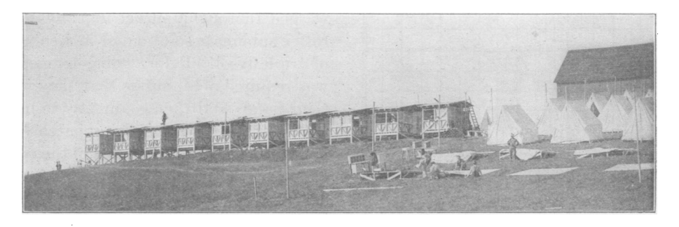
FIG. 5. Lawrence Hospital, Panorama View.

to go near a patient unless wearing one of these masks. The gauze on the masks was changed every two hours. It was found impractical to sterilize the mask with the gauze on, owing to the fact that in the process of sterilization a great deal of the