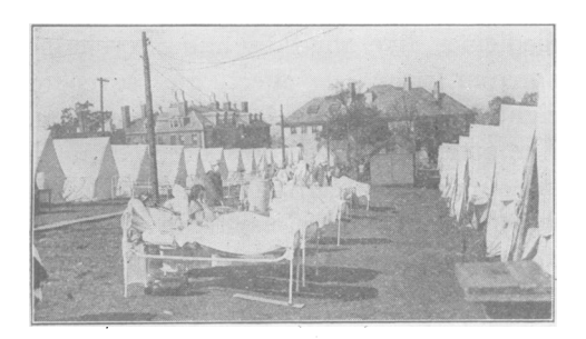
FIG. 2. Open Air and Sunshine, Camp Wm. H. Brooks, Corey Hill.

died, not from heart failure, but from abscesses in the lungs. This explained why the heart stimulants had had practically no effect on the cyanosed patients,