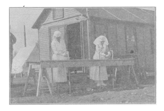
FIG. 4. Out-Door Wash Stand, Hand Technique, Camp Wm. Brooks.

Very few of the attendants and nurses contracted influenza while working in the tent hospital. One nurse who worked