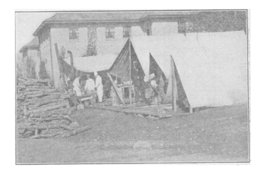
FIG. 6. Cook Tent, Camp Wm. Brooks.

fuzz on the gauze was removed and its value as a strainer was diminished. Nurses and orderlies were instructed to keep their hands away from the outside of the masks as much as possible. Every wearer of a mask was inclined at first to wear the mask too high up on the nose and a great deal of