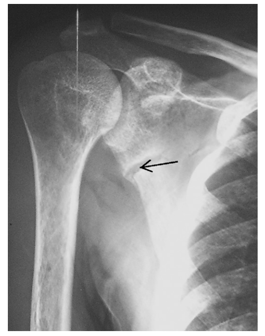
Fig. 3. Looser's zone (pseudofracture) in scapula ( arrow ).

Radionuclide bone scans are most useful in evaluating patients with suspected osteomalacia. This imaging method can present in many different ways ranging