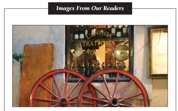
Wheels in front of window in Rome, Italy.